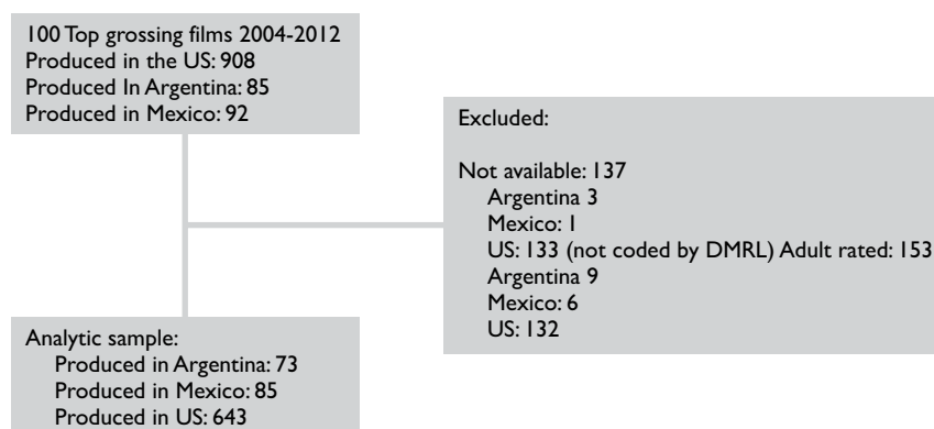
FIGURE I. MOVIES ANALYTIC SAMPLE SELECTION FROM ARGENTINA, MEXICO, AND USA TOP GROSSING FILMS 2004-2012