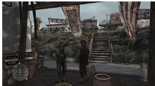
Figure 1: Red Dead Redemption (Rockstar, 2010)