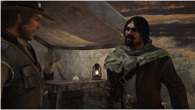
Figure 5: Red Dead Redemption (Rockstar, 2010)

Marston's impression of Reyes is the opposite of what tales make him out to be. He womanizes and makes the same promise to all of them, which he never keeps. He dreams of a Mexico where he will be president and have all the pleasures of life at the expense of the pueblo . He is more concerned about corridos of him than the heroic deeds of the soldaderas that give their lives for his cause, which is another accurate historical representation of the game. During Marston's missions with the federales , several of the hideouts they cleared had women fighters guarding these compounds. I walked past the dead bodies of revolutionaries and saw women's bodies dressed in bandoliers, charro hats, and long skirts. During the gun fights, war cries of " Viva México! " or " Al ataque, camaradas " in the female tone rallied the troops. As I was covering from bullets, I listened to these heroic women give instructions and noticed male NPCs obey and move into position according to the instructions they were receiving. Rockstar's portrayal of Reyes is through a conservative approach where Marston questions his every intention with words like radical, tyranny, and liberty, to which Reyes smirks: " You gringos want to control everything. " At the end of Marston's Mexican storyline, he switches to the rebel cause in hopes of eliminating Allende. When they succeed, and the men he's looking for are killed, the storyline brings him back to the other side of the border.