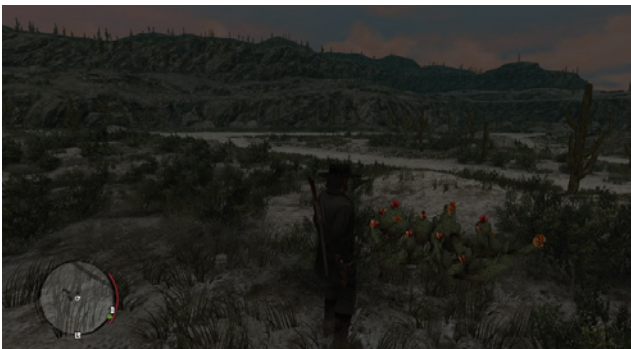
Figure 2: Red Dead Redemption (Rockstar, 2010)

knowledge reference pulque as a type of alcoholic beverage. To Mexicans, the drink is as emblematic as its indigenous civilization. Ian Bogost writes about the use of fast food in GTA San Andreas and its status as a source of food for low socioeconomic people (87). Pulque is not consumed in of the establishments of the game world. Mexico is not an indication of poverty but more of a symbol of national identity. Pulque has been traced back as far as the Aztec empire, with peak demand during the Mexican revolution. The historical context of Pulque here is twofold: With the advent of the railroad in Mexico, Pulque found a place outside the haciendas in central Mexico and outward to the country. With President Porfirio Diaz's courting of foreign investment, breweries emerged, pitting pulque and beer against each other. With full government support, breweries launched misleading marketing campaigns framing pulque as a low-class unhygienic beverage fermented with feces. History shows that pulque overcame adversity and became the beverage of the revolutionary forces and a symbol of national identity in the post-revolutionary period. Irish's reference to pulque is not an indicator of a poor country but a symbol of resistance that survived the destruction and colonial power, as well as remains rooted in today's society. Resistance was shown by Mexican rebels defending their sovereignty while attempting to stop two Americans from crossing into their homeland.