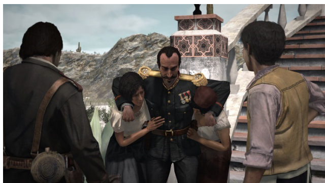
Figure 4: Red Dead Redemption (Rockstar, 2010)

Ludology played a big part in understanding the inability to change history, but narratology has more importance in the knowledge of backgrounds that yield cultural and historical context. Players discover that Colonel Allende was once an idealist who believed Mexico should be free—only to be consumed by his love of power, money, women, and sex through cutscenes. Historical pictures—particularly those in the Historia gráfica de la revolución mexicana portray military men with vice paraphernalia. Pictures of Victoriano Huerta with a cigar and a cognac cup, or a general with an alcoholic beverage or a woman by his side were popular. Colonel Allende's house has those same elements. Through gameplay, Marston can walk up to his compound and notice the abundance of women and alcohol bottles. At the start of the mission, Colonel Allende is fondling a woman while he tries to explain his strategy. With a wave of his hand, he orders his men out, picks the woman up over his shoulders, and goes inside the house.