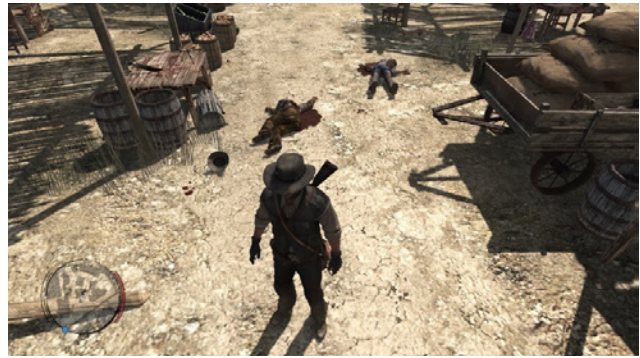
Figure 4: Red Dead Redemption (Rockstar, 2010)

The “law” gave accused people the option to run for their freedom, but they were immediately shot in the back as soon as they turned. This important historical event took 10 seconds to unfold, and I am comfortable saying that most gamers (outside of Mexico) miss this historical reference. Augusto Boal's spectator model fails because as I tried to shoot the federales , I was quickly gunned down by the townspeople while negatively impacting my honor and fame. The ludic consequence in this situation is that the player is punished for interfering in an act of “justice.” The game's rhetorical procedure was set to evoke a sense of disbelief or anger, as well as teach the gamer a lesson by experiencing a semblance of the terror and violence villagers in Mexico felt hearing these banditos ride in, commit acts of violence and leave without explanation or remorse.