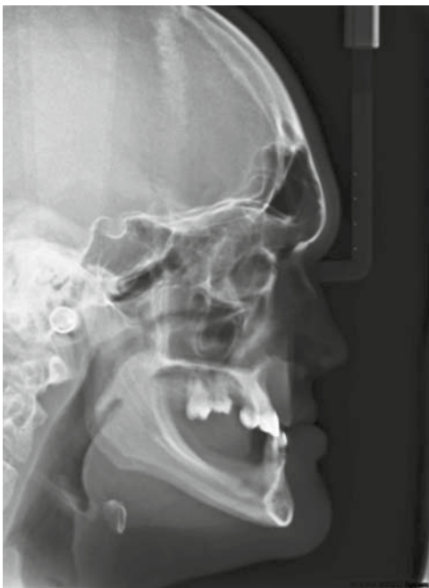
Figure 2. Lateral X-ray showing absence of alveolar process in toothless region of upper and lower jaws.

HED is an alteration which allows easy and timely diagnosis due to its characteristic presentation: