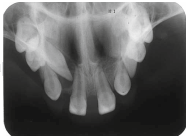
Figure 3. Occlusal X-ray of upper jaw showing placement of teeth present in the arch.

There are HED reports in scientific literature on clinical cases with different characteristics and alterations such as: poor dental occlusion with presence of diastemata, microdontia, shape alterations in crown and root, extensive and early tooth decay, enamel hypoplasia, altered pulp chambers, oligodontia, persistence of primary teeth, delays of permanent dentition eruption. 2,7,11,12,13,15 Additionally, literature