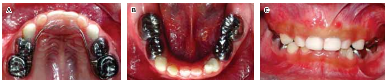
Figure 11. A, B, C. Anterior and occlusal final photographs. Steel-chrome crown restorations in molars, resin restorations in canines and front teeth.