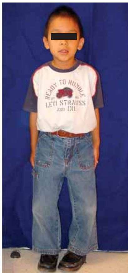
Figure 1. Lower limbs arching.