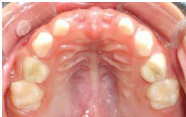
Figure 3. Upper occlusal view. Caries free primary dentition and absence of teeth 51 and 61.

The base diagnosis of the patient was considered, as were clinical findings found in scientific literature.