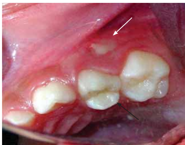
Figure 6. Left lateral view: fistula at tooth 61 level (white arrow) and absence of caries (black arrow).