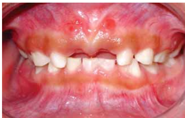
Figure 4. Anterior view. Fistulae scars in attached gingival at teeth 51 and 61 level.

On the strength of that information, it was decided to conduct treatments recommended by several authors.