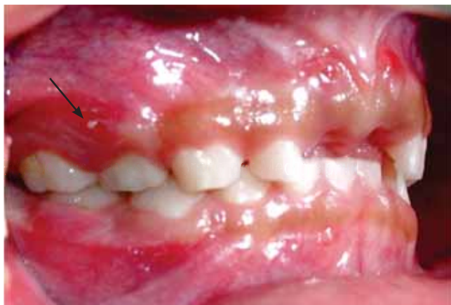
Figure 5. Right lateral view: fistula at tooth 51 level (arrow).