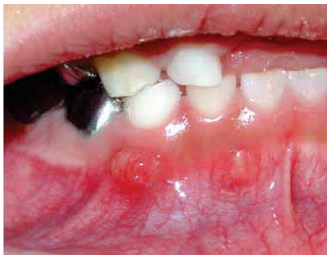
Figure 9. Periapical abscess in teeth 82 and 83.

would be to perform prophylactic pulpotoomies with chrome-steel crowns on all primary molars. 1-3,7,11-13