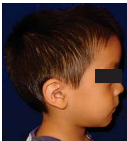
Figure 2. Frontal bone bulging due to sagittal suture synostosis.

remaining structures were unaltered. Dento-alveolar x-rays revealed enlarged pulp chambers with pulp horns extending up to the dentin-enamel junction as well as fusion of teeth 72 and 73. The remaining structures were unaltered (Figure 8).