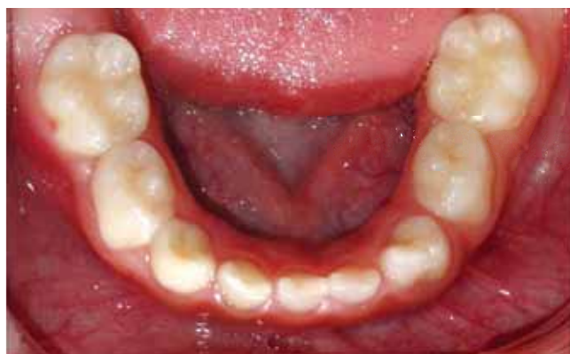
Figure 7. Lower occlusal view. Caries free primary dentition. Fusion of teeth 72 and 73.

was observed, it was decided to extend preventive treatment with pulpotomies to the remaining canines which, so far, had not presented abscesses. Therefore, at the fourth appointment a pulpotomy with restoration made of glass ionomer and resin was performed on tooth 53.