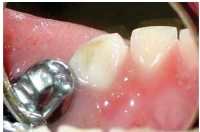
Figure 10. Teeth 82 and 83 free of caries.

At the Instituto Nacional de Pediatria (National Pediatrics Institute) experience gained when treating this group of patients has allowed us to observe the