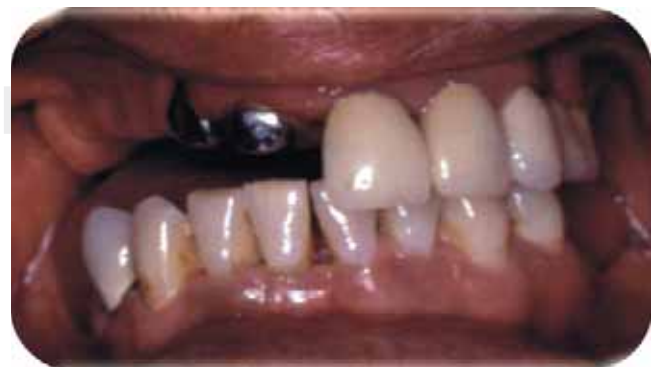
Figure 1. Initial picture.

Operative dentistry was performed on affected teeth. Periodontal phase 1 and debridement with a flap on tooth 11. Once periodontal stabilization was achieved, reconstruction and placement of provisional restorations on teeth 11 and 12 were undertaken.