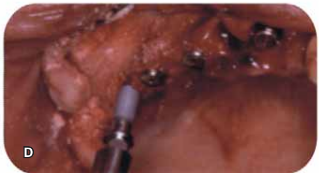
Figure 4. Surgical procedure. A) A lateral window was established with an electrical hand-piece. B) Rotation of bone window and dissected membrane. C) Preparation of surgical bed in combination with bone expansion. D) implants in place.