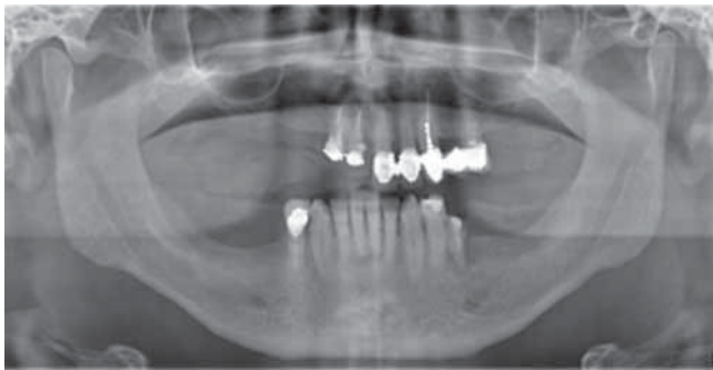
Figure 2. Initial x-ray.

To this effect, O.S.A.S (Orthodontic Skeletal Anchorage System) orthodontic mini-implants were used to achieved slow, forced extrusion. Implants were placed in vestibular position at the level of tooth number 43. Rubber bands were placed connecting mini-implants with the provisional restorations. Treatment continued by applying 3.5 ounce force (99.22 g) with 1/4 \Phi rubber bands, every day during three months. These rubber bands were later replaced by 3/16 \Phi rubber bands.