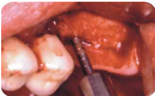
Figure 5. Elevation of sinus with osteotomes.

After the operation, the patient was prescribed with amoxicillin and clavulanic acid 500/125 mg, every 8 hours for 10 days, ibuprofen 400 mg every 6 hours for 5 days, loratadine 10 mg one daily for 3 days, 0.12 chlorhexidine mouthwash every 12 hours for 2 weeks, oximetazoline 50 mg/d nasal drops for 3 days. A provisional bilateral removable device was fitted to enhance esthetics. All sutures were removed 10 days after the operation. The patient was subject to radiographic and clinical follow-up at 4, 5 and 6 months. During the interval, conventional extractions of teeth number 35 and 44 were performed (Figure 6).