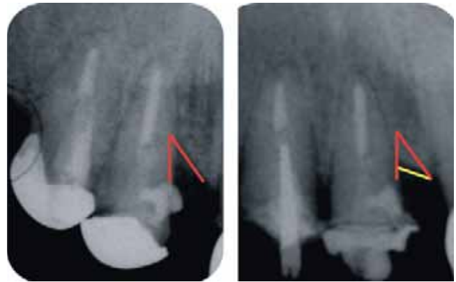
Figure 3. Forced extrusion results. A) before forced extrusion. B) after forced extrusion. The highlighted line indicates decrease of vertical bone defect.

These bands daily exert a 4.5 ounce force (127.57 g). Slow, forced extrusion was conducted for a 5 month span ( Figure 3 ). Once the vertical bone defect present in tooth number 11 was corrected, mini-implants were removed and the restoration was stabilized for one month.