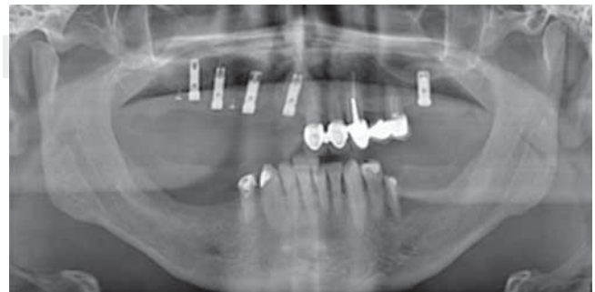
Figure 6. Panoramic x-ray with implants in place.

Impressions were taken with personalized open spoon, with impression posts placed in corresponding implants. Splints were achieved with duralay acrylic, using heavy and light body vinyl-polysiloxane (Virtual, Ivoclar). A new waxing procedure was undertaken to determine position and size of teeth. Based on it, a