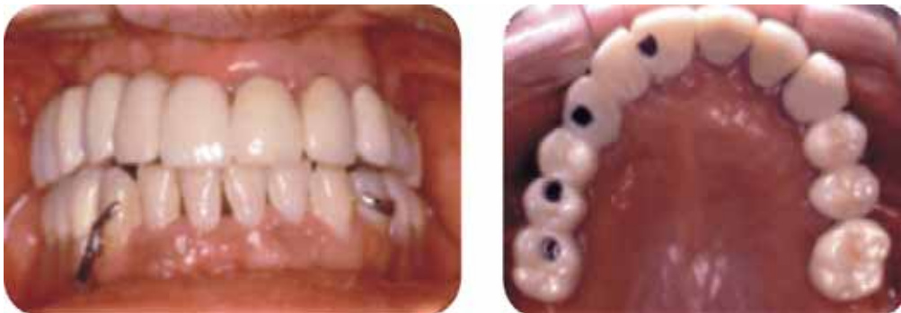
Figure 8. Final result pictures.