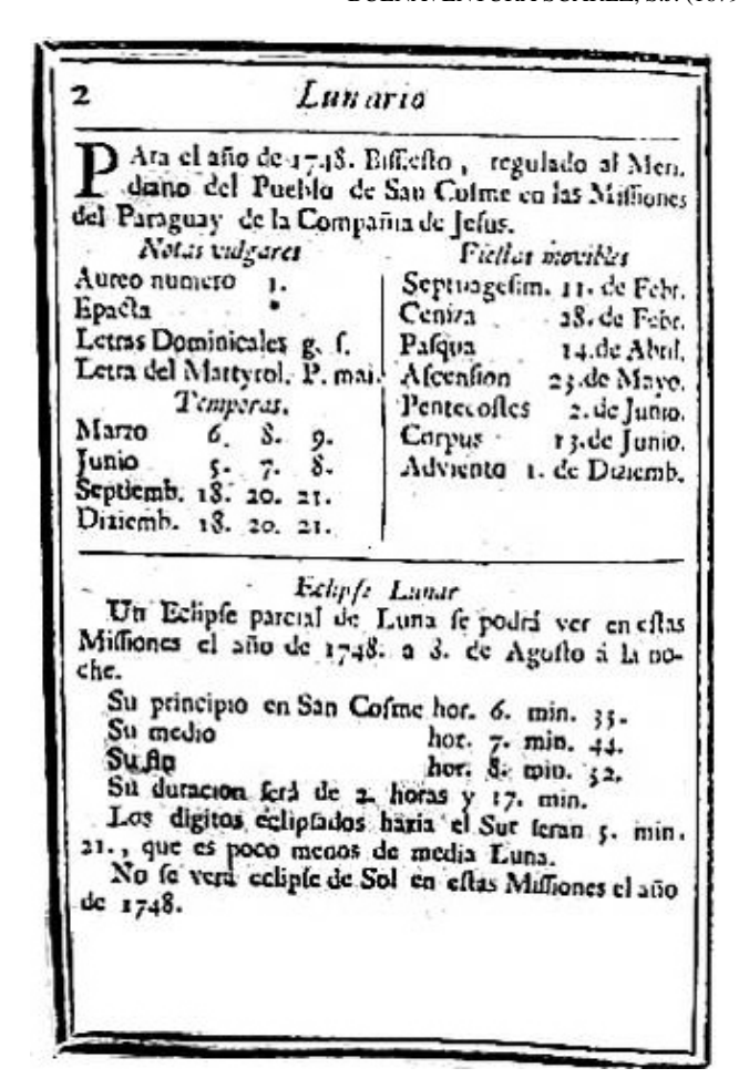
FIGURE 3. Sample of an even-numbered page of the ephemerides section.