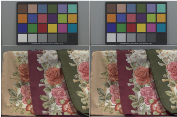
FIGURE 4. Visual color comparison between the digital reproductions of the training and target images, in the left side are shown the images reproduced by using a spectrum based estimation method, in the right side are shown the corresponding images reproduced in this study.