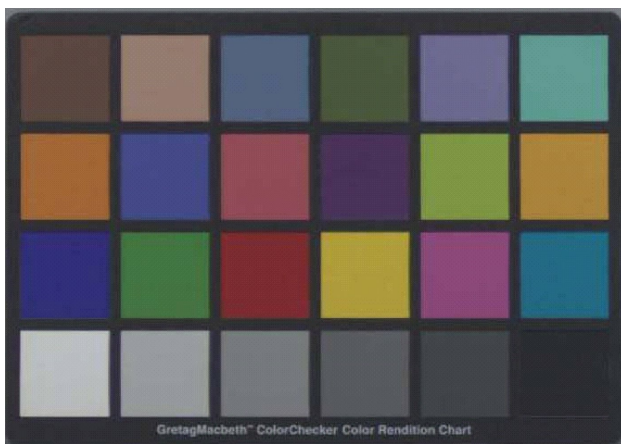
FIGURE 2. Image of the Macbeth color test chart used for this experiment.