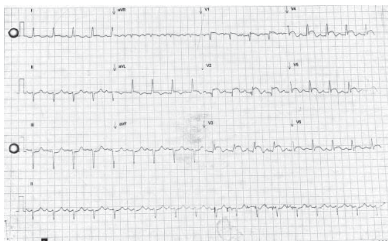
Figure 1: Electrocardiogram showing ST-segment elevation in anterior leads with T-wave inversion.

We did a retrospective cohort study, with 622 consecutive patients admitted at the emergency department of the National Cardiology Institute in Mexico City with a diagnosis of STEMI who