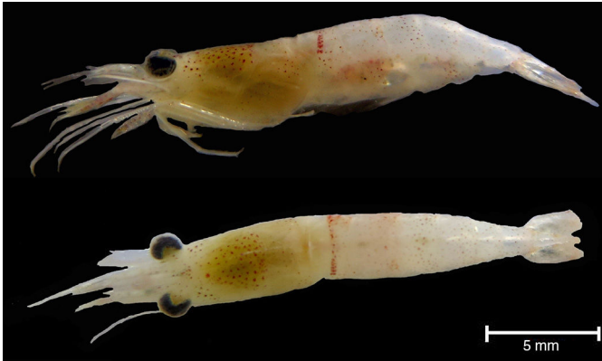
Figure 2. Lateral and dorsal views of adult female of Ambydexter symmetricus Manning & Chace, 1971 from Seybaplaya, Campeche, Mexico.

Yucatán Peninsula and an addition to the 35 species of caridean shrimp reported for Campeche (Hernández-Aguilera, Gracia, & Illescas, 2010). Álvarez et al. (1999) assumed the presence of this species on the coast of Veracruz, and considering the present report we infer the possible presence of A. symmetricus in the entire Gulf of Mexico.