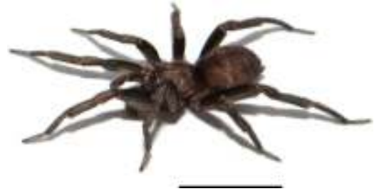
Figure 1. Stenoterommata uruguayi . Male (LZI0350), habitus. Scale: 1 cm.

The following abbreviations are used: ALE, anterior lateral eyes; AME, anterior median eyes; D, dorsal; ITC, internal tarsal claw; OQ, ocular quadrangle; P, prolateral; PLE, posterior lateral eyes; PLS, posterior lateral spinnerets; PME, posterior median eyes; PMS, posterior median spinnerets; R, retrolateral;