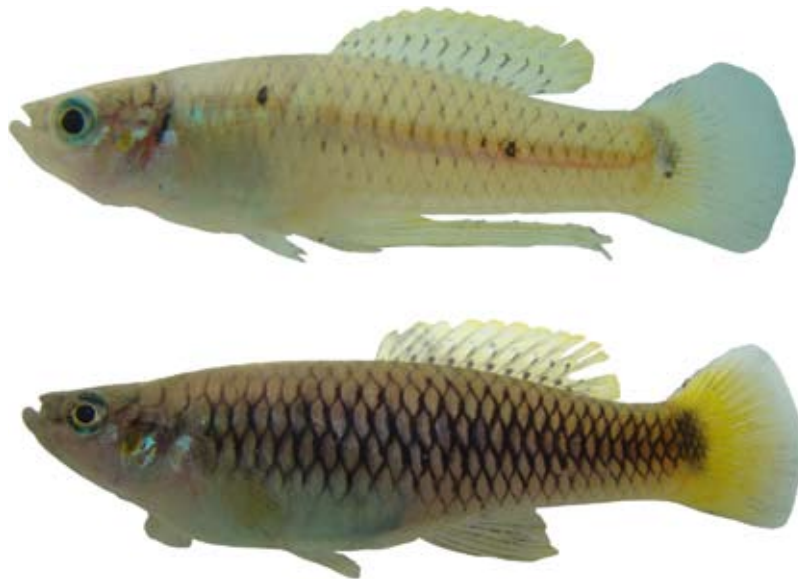
Figure 2. Heterandria anzuetoii (LSUMZ 15119) male (top) and female (lower) captured in the Paso Hondo River, Lempa River basin, Department of Cabañas, El Salvador, 2011.