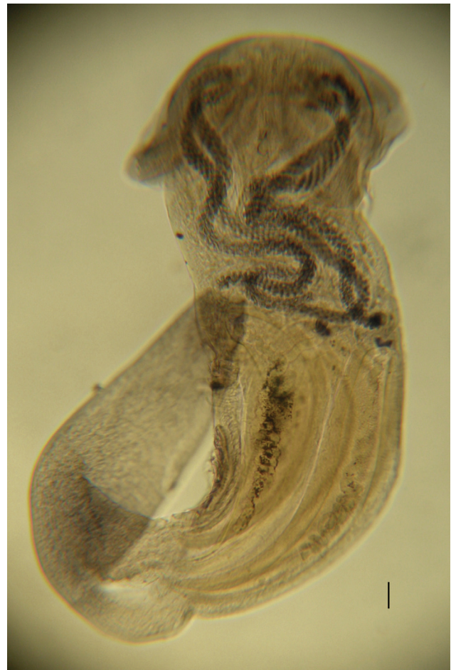
Figure 2. Micrograph of the larval cestode from Euphausia americana . Scale bar: 0.06 mm.