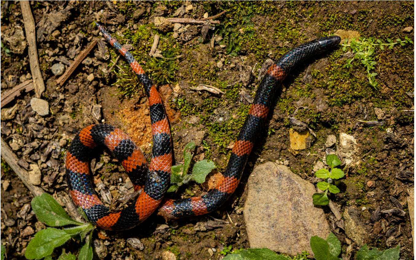
Figura 1. Individuo de Geophis lorancai en las inmediaciones de Huautla de Jiménez, Oaxaca, encontrado muerto por pobladores locales (CH-CIB 126). Figure 1. An individual of Geophis lorancai from the vicinity of Huautla de Jiménez, Oaxaca, found dead by local villagers (CH-CIB 126).