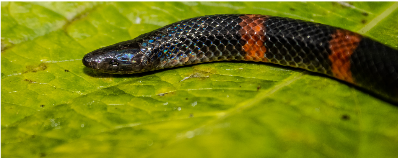
Figura 2. Acercamiento a la cabeza de Geophis lorancai de las inmediaciones de Huautla de Jiménez, Oaxaca. Nótese la presencia de la escama supraocular que es un carácter diagnóstico de esta especie.