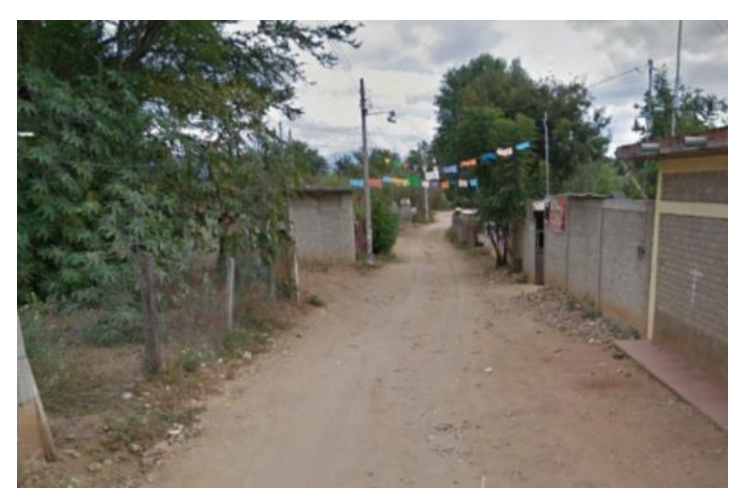
Figure 2. Natural environment of the central area of the SMTO.

It was learned that the infrastructure and services in the community are minimal, the streets lack paving and there is a health center to give attention to the population. According to information obtained from interviews with officials of this clinic, there is an increase in cases of diseases, mainly gastrointestinal, due to the lack of infrastructure for wastewater sanitation (Gobierno del Estado de Oaxaca, 2013).