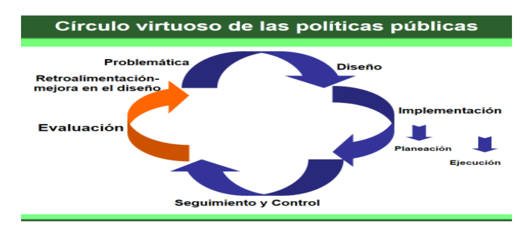
Figure 1. Virtuous circle of public policies in Mexico.

The present work of a socio-economic nature has as a frame of reference the theory of the evaluation of public policies, framed in the general context of the virtuous circle of public policies, where the evaluation process plays an important role in decision-making for the improvement of these (Figure 1).