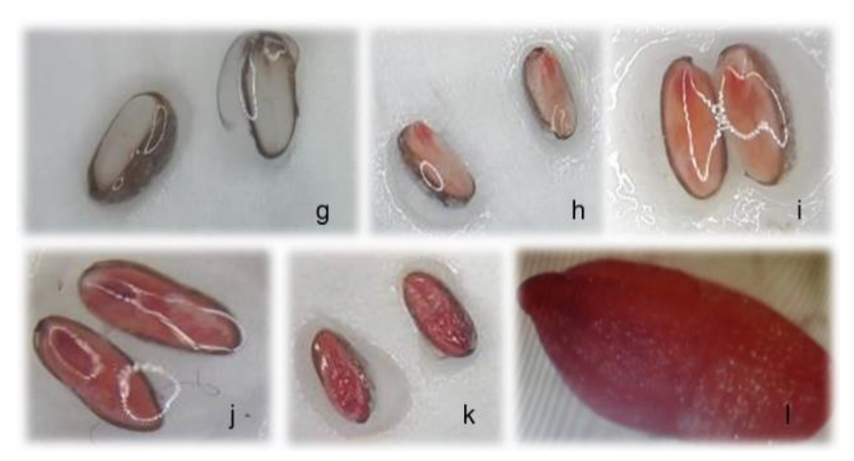
Figure 2. g) non-colored, non-viable seeds; h) viable seeds chlorination 0.075%; i) viable seeds concentration 0.1%; j) viable seeds, concentration 0.5%; k) and l) seeds with intense red coloration, 1% concentration of tetrazolium salt.

It is emphasized that in studies of this nature the use of lots with differentiated quality is fundamental, since a certain methodology must be sufficiently sensitive and at the same time robust to detect subtle differences between lots of both high and low quality.