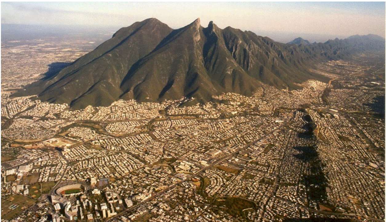
Figure 1. Panoramic view of Cerro de la Silla Natural Monument in Monterrey city, Mexico.

The MNCS is part of a mountain range that extends southeast from the metropolitan area of Monterrey along 42 km in an altitudinal range of 500 to 1 782 m. Together with the Sierra Cerro de la Silla state protected area, it constitutes a continuous corridor of natural vegetation that amounts to 16 639 ha (Cantú et al. , 2010); both areas represent an important source of environmental services that supply water to the Metropolitan Area of Monterrey (AMM), mainly (DOF, 2014) (Figure 1).