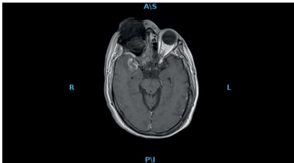
Figure 2. Magnetic resonance imaging of the skull showing soft tissue opacification of the sinuses with extension of necrosis to the orbital zone (which causes hypointensity).

1.8 \times 10^3/\text{ml} , hyponatremia of 130 (normal: 135–145 mEq/L), and hypokalemia of 3.18 (normal: 3.5–5.0 mEq). Clindamycin, levofloxacin, and intravenous amphotericin were started as part of the antibiotic therapy after the histological diagnosis confirmed the presence of mucormycosis.