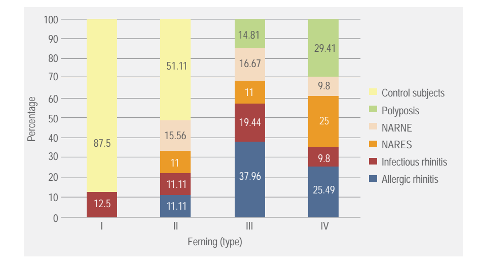
Figure 2. Frequency of different rhinitis within each ferning type.

In this regard, the fern test could be a very simple and useful method to investigate mucus in patients with rhinitis. The current study, conducted in a real-world setting, such as a Rhinology Unit, proved that rhinitis is associated with impaired fern patterns. In particular, healthy subjects have only type I or II fern patterns and never III or IV. On the