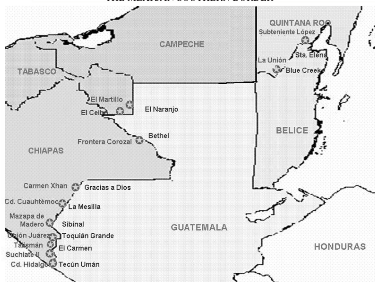
MAP 1 ENTRANCE POINTS WITH MIGRATORY PRESENCE AT THE MEXICAN SOUTHERN BORDER