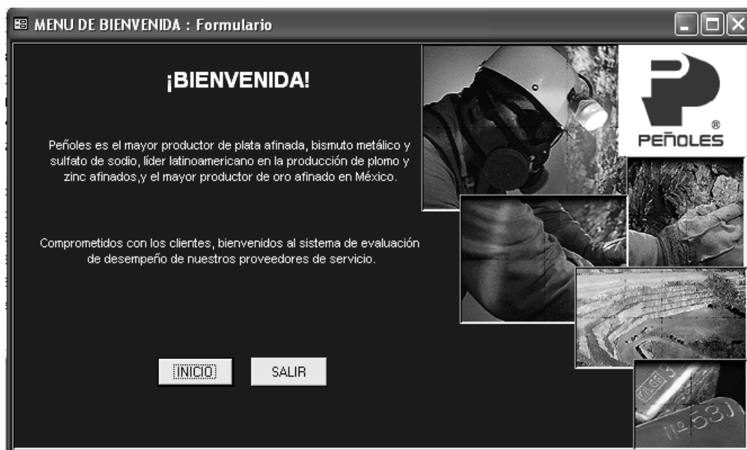
A1 Starting screen