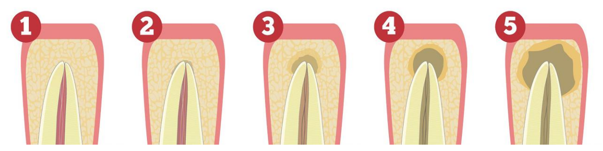
Figure 1. Representation of the periapical index.

The evaluation was made independently by two endodontic experts that were previously calibrated. The agreement between the observers was 89.74%. The four cases with disagreement were analyzed by a third endodontic expert independently. The final score for that four cases was recorded according to the agreement between the third observer and one of the original observers. Data collected was organized in an Excel® data base and percentages and graphics were calculated afterwards, the T Student test for paired data was used to observe differences between the initial and final scores. The distribution of the sample was normal.