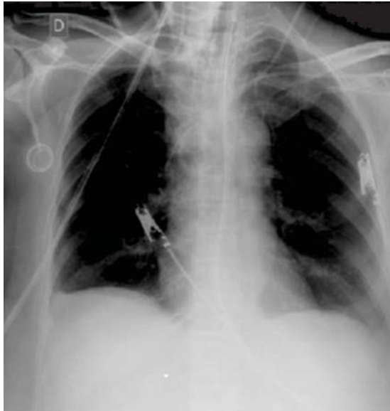
Figure 3. Recent chest radiograph of control showing absence of pleural effusion, and the implanted port for chemotherapy (at the anterior chest region and below the right clavicle).