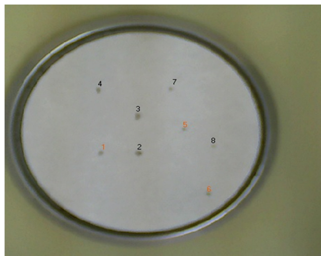
Fig. 2. Example of the output image on the PC screen when the weighing process has succeeded.

When the PC receives the ready signal from the analytical balance, in addition to reading the piece's weight, it sends a signal to the webcam to acquire a photograph. To control the