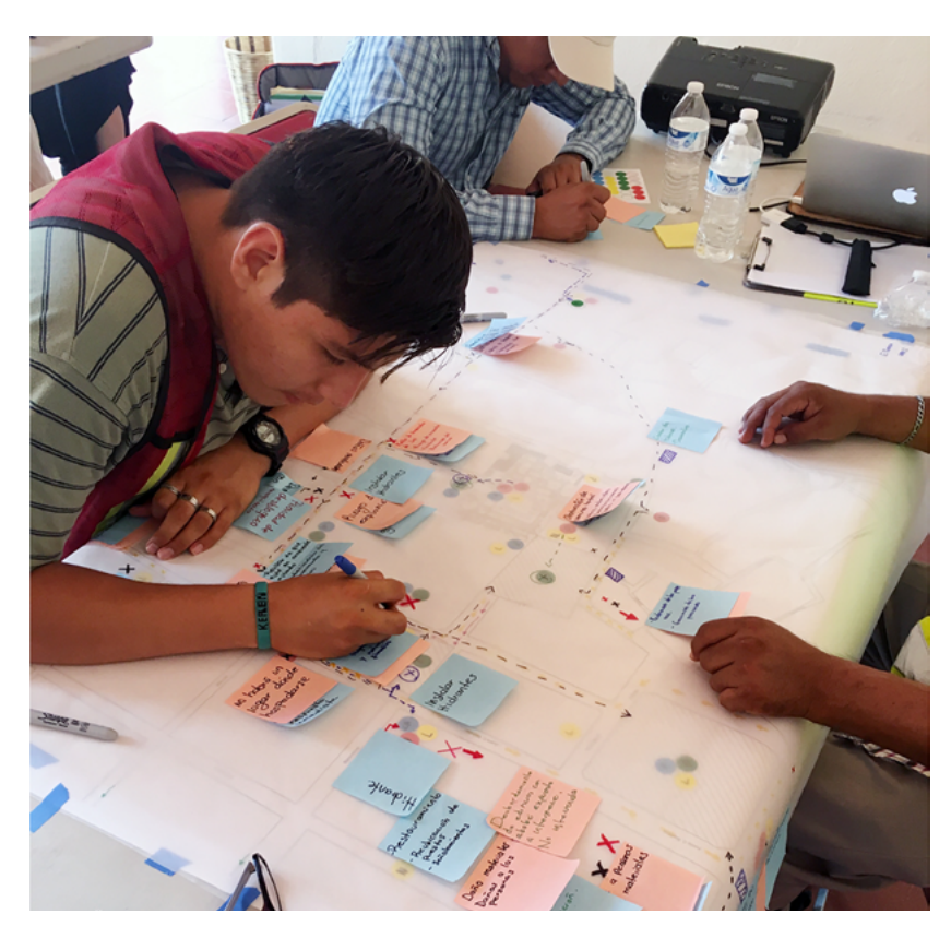
<sup>12</sup> The Subprogram forms part of the National Strategy of the CNCPC and the INAH.