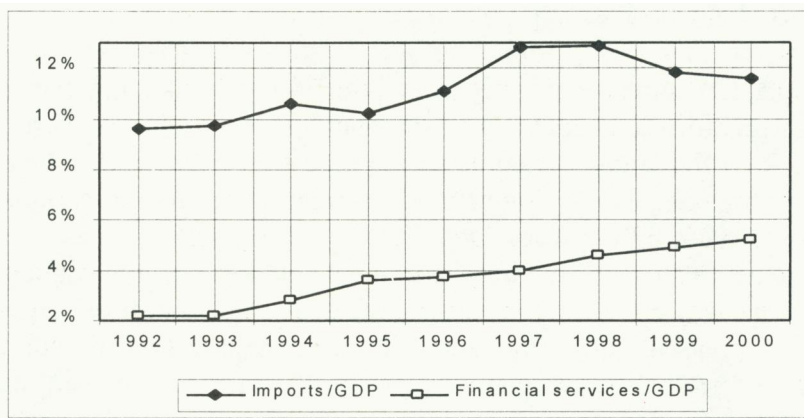
CHART 3. USES OF FINANCIAL FLOWS AS SHARE OF GDP

The adoption of the Convertibility Law was to have two major benefits for the economy. In addition to the automatic stabilization of the internal and external balance at a stable price level, it was also meant to reduce domestic interest rates and the resulting increase in investment was to support growth. During the period of hyperinflation, nominal interest rates had to compensate for the loss of purchasing power due to domestic inflation, as well as the loss of purchasing power due to devaluation of the external value of the currency. Price stability would eliminate the inflation adjustment while the currency board, by insuring that every peso in circulation was backed by a US dollar, would eliminate the exchange rate risk. A loan to an Argentine borrower would be no different than a loan to a US borrower, since pesos were backed by dollars and debt service could thus be guaranteed in dollars. It was thus expected that domestic interest rates and international borrowing rates would converge toward US levels. The convergence would not be complete since other aspects of risk associated with particular borrowers and local conditions, would still differ, but the spread over dollar rates was