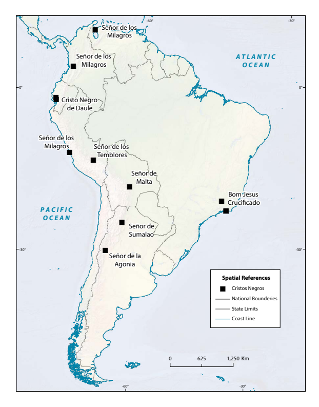
Figure 1. Territorial distribution of black Christs in South America.

Most images are housed in small temples displaying images that directly refer to the Christ of