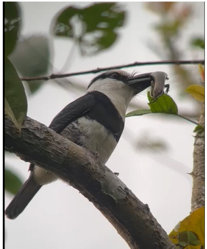
Figura 2. A White-necked Puffbird ( Notharchus hyperrhynchus ) holding a Central American Mabuya ( Marisora unimarginata ) that it had captured and beaten on a branch of a tree at Los Naranjos trail, Sirena sector, Corcovado National Park, Costa Rica.

Our observation provides the first documented evidence of predation on a lizard by the White-necked Puffbird in the Neotropical forest. This is import-