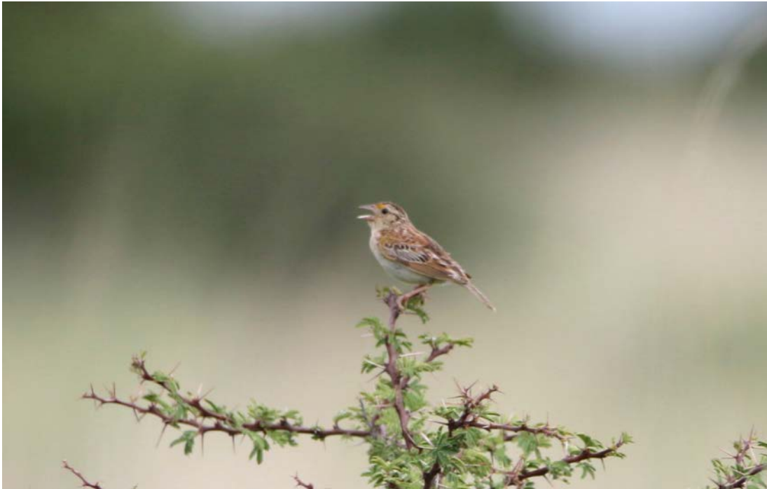
Figure 2. Grasshopper Sparrow ( Ammodramus savannarum ) singing male at North of Durango, summer 2017.

dis (Cane bluesteam), confirming with it the first documented breeding record in the state of Durango during summer.