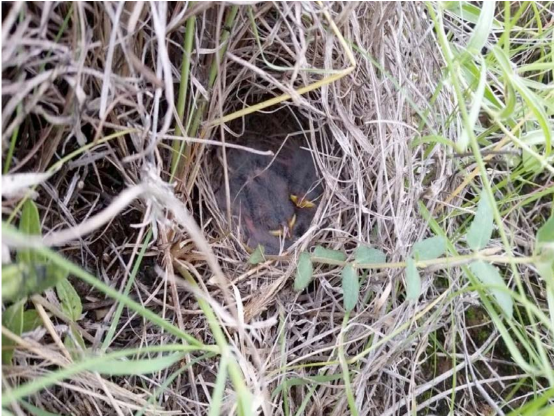
Figure 3. Nest of Ammodramus savannarum, summer of 2017, at North of Durango.

2017), the date of our breeding record in the grasslands of Durango at CUZA supports these statements.