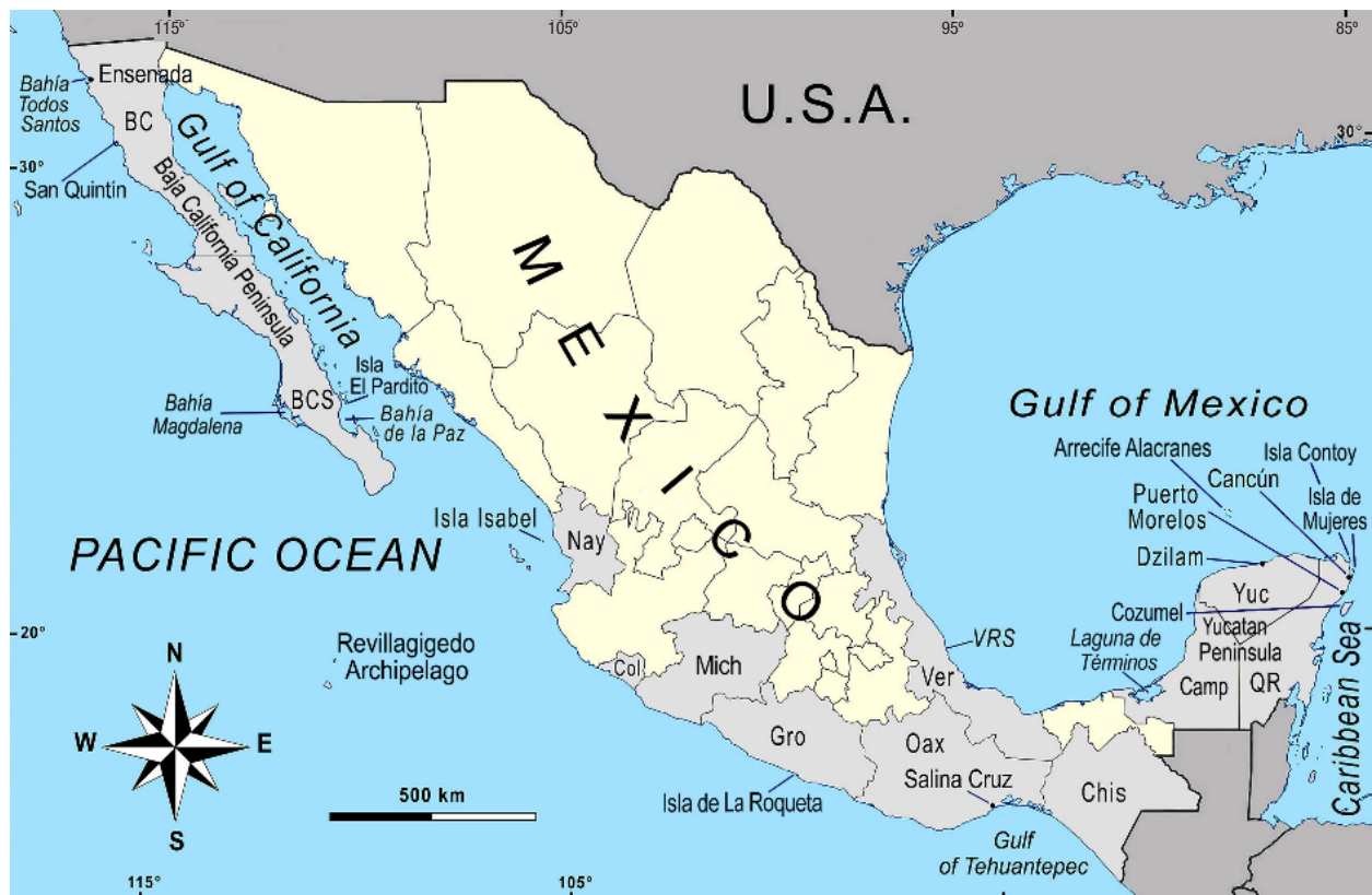
Figure 1. Location of the origin of marine benthic dinoflagellates and related studies reported in Mexico (1942–2022). Mexican states, including islands where field sampling was performed, and benthic dinoflagellates were found, are shaded light gray. Only geographic names mentioned in the text are given.

Dinoflagellate reviews have highlighted the importance of life-history transitions in HAB dynamics ( e.g. , Bravo & Figueroa, 2013), but reports of confirmed sexual cysts of benthic dinoflagellate species remain scarce on a global scale. There are publications on resting (sexual) cysts of planktonic dinoflagellate species collected from the benthic environment in the Mexican Pacific (cited below) that are outside the scope of this review. Studies of dinoflagellate cysts (presumably, hypnozygotes) of planktonic species of the Gonyaulacales, Peridiniales and Gymnodiniales dominate the literature from Mexico (Martínez-Hernández & Hernández-Campos, 1991; Peña-Manjarrez et al. , 2001, 2005, 2009; Morquecho & Lechuga-Devéze, 2003, 2004; Kiehl, 2006; Pospelova et al. , 2008; Vásquez-Bedoya et al. , 2008; Morquecho et al. , 2009; Limoges et al. , 2010, 2013; Helenes et al. , 2020; Gu et al. , 2021), whereas the resting cysts and life history transitions of benthic species are poorly known. As noteworthy exceptions, from the benthic community, cysts of Amphidinium cf. carterae Hulburt have been recorded in shallow coastal lagoons (Gárate-Lizárraga, 2012, 2020; Gárate-Lizárraga et al. , 2019) and those of A. thermanum Dolapsakis et Economou-Amilli in laboratory cultures isolated from Bahía de La Paz (Herrera-Herrera, 2022).