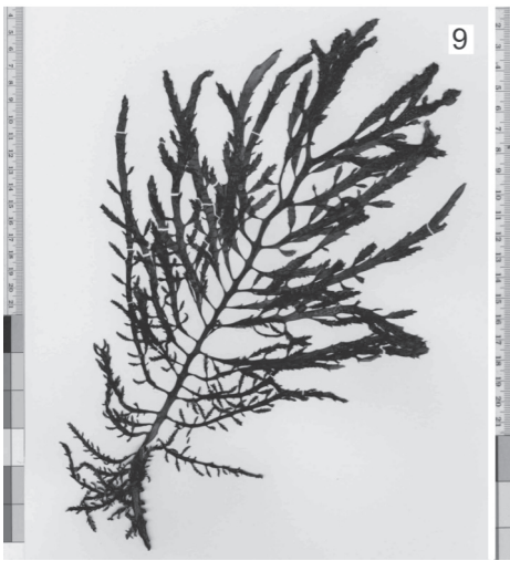
Figure 9. Eisenia desmarestioides (UC 1716997). Dredged at South Anchorage, Isla Guadalupe by P. C. Silva (#6382) on 29 January 1950. Well-developed desmarestioides type morphology.

Esta nota contiene un error en la pag. 170, fig. 10, repitiéndose la imagen de la fig. 9. La versión definitiva se presenta a continuación: