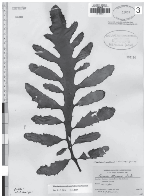
Figure 3. Eisenia masonii (AHFH 19039 in UC). Collected by Carl L. Hubbs (#46-152) at 45-49 m depth on 7-8 December 1946 at Isla Guadalupe and determined by E.Y. Dawson. Annotated as "fertile!" by E. Y. Dawson.