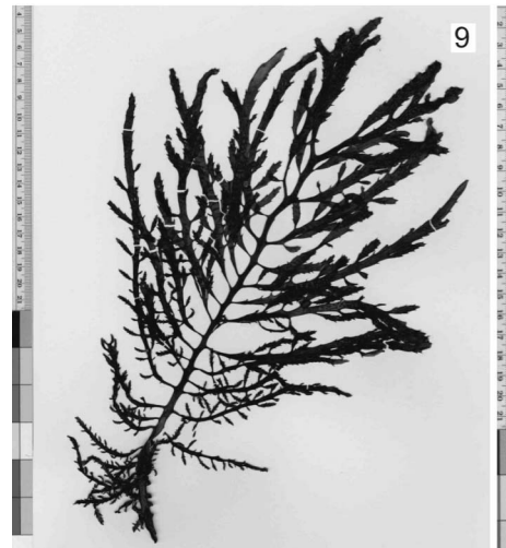
Figure 10. Eisenia desmarestioides (AHFH 79196 in UC). Same collection data as for figure 7. Arrow 1 indicates point of insertion of desmarestioides type blade; arrow 2 indicates development of that blade into a form intermediate between the desmarestioides and masonii types.

Both were referred to E. masonii by Dawson. The latter collection was the first to provide information on the depth of occurrence (24.5-27 fms = 45-49 m). Stewart and Stewart (1984) reported that Eisenia was the only conspicuous seaweed at depths of 20-33 m in an unmarked inlet near Caleta Melpómene that they named "Chaetodon Cove". A specimen from this collection, which was not used in this study, was deposited at CMMEX (Herbario, Facultad de Ciencias Marinas, Universidad Autónoma de Baja California).