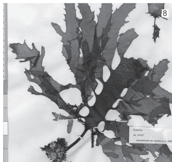
Figure 8. Juvenile Eisenia desmarestioides (AHFH 79198 in UC). Same collection data as for figure 7. Note two desmarestioides type blade initials at base of primary blade.

The fragment representing E. masonii (Fig. 1) is pinnately divided with broad dentate pinnae, the older of which are stipitate and bear small dentate pinnules. The fragment (and only representative) of E. desmarestioides (Fig. 2) has abundant pinnate divisions, the primary pinnae being long and narrow, with an abundance of long and narrow dentate pinnules.