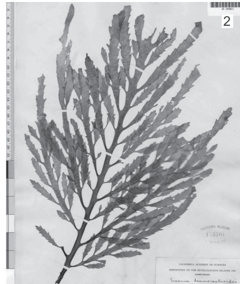
Figure 2. Holotype of Eisenia desmarestioides (CAS 173701 in UC). Collected by Herbert L. Mason (#6) at Isla Guadalupe in April 1925.