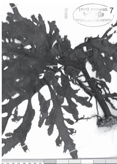
Figure 7. Eisenia desmarestioides (AHFH 79197 in UC). Collected by John Hansen at Islote Negro, off east side of Isla Guadalupe at 6 m depth on 16 December 1972. Arrow indicates point of insertion of desmarestioides type blade at base of pseudostipe. The other blades are of the masonii type.