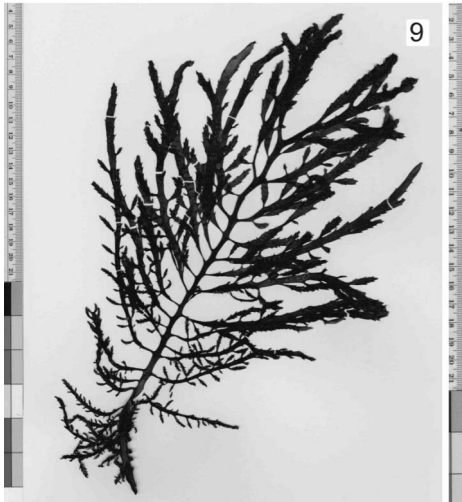
Figure 9. Eisenia desmarestioides (UC 1716997). Dredged at South Anchorage, Isla Guadalupe by P. C. Silva (#6382) on 29 January 1950. Well-developed desmarestioides type morphology.