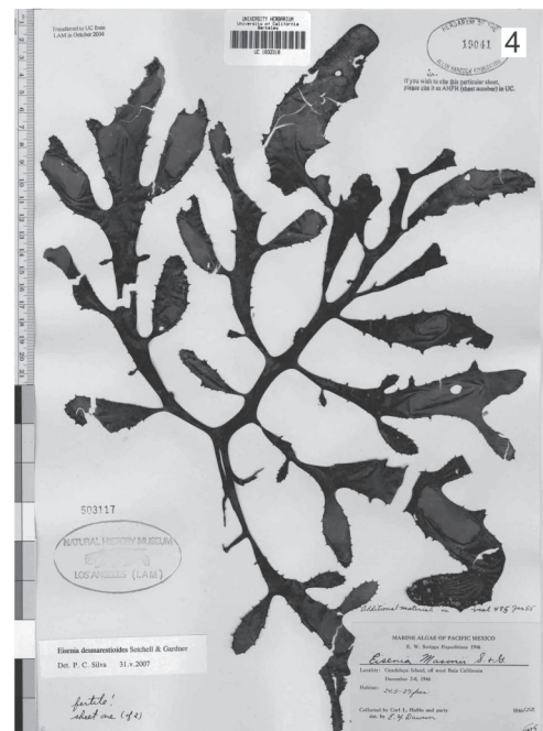
Figure 4. Eisenia masonii (AHFH 19041 in UC). Same data as for Figure 3.

found that all but one formed a morphological cline, varying in degree of pinnate dissection but with the pinnae consistently broad. The exceptional fragment had primary and secondary pinnae that were consistently narrow. On the broadly pinnate blades, Setchell and Gardner found sori with sporangia and para-