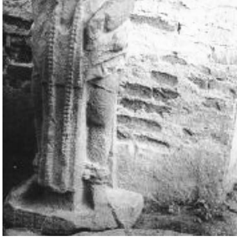
FIGURE 3. The Santo Ton statue (after Blom and DUBY, 1955-57).