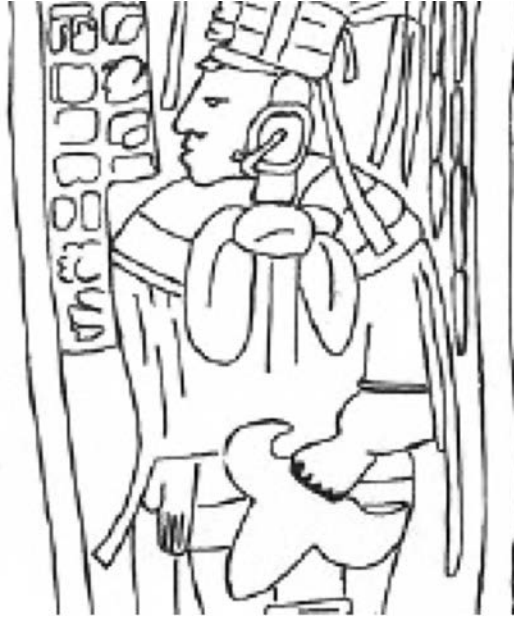
FIGURE 2. Ujaltón Mon 1.

of Ujaltón. They were once on this site” (Mayer, pers. com., 2011, Bassie-Sweet et al. , in prep.). “The Classic Period community of Ujaltón was situated at the bottom of the Tila valley near Petalcingo. Ujaltón was well placed to control not only the route to the east over the Tumbalá mountain, but also the route to the west along the Río Sabanilla to the Tabasco coastal plain. The amber deposits of Simojovel are just thirty kilometres to the southwest”. “These monuments indicate that there was a Late Classic Period elite population residing in the valley from at least A.D. 685 to A.D. 840” (Bassie-Sweet et al. , in prep.).