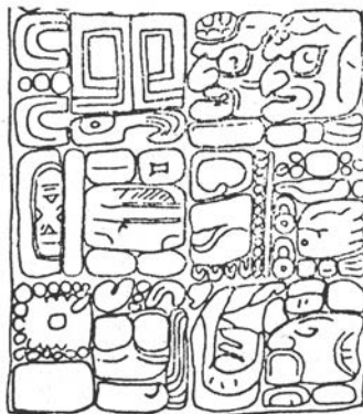
FIGURE 4. The Santo Ton pedestal inscriptions (after Blom and DUBY, 1955-57).