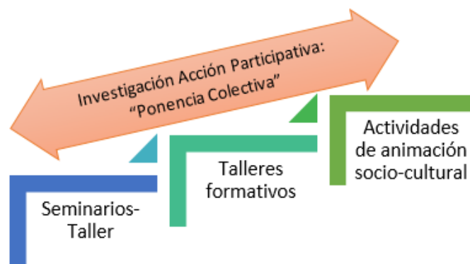
Figure 6. Methodological proposal of the Post-Conflict Diploma Course

To guarantee such a pedagogical exercise at the methodological level, the Diploma Course was structured around three types of activities and a transversal component (see Figure 6). The process was conducted, as proposed by Paulo Freire (1990), at a momentum of critical self-reflection of the time and space we live in, to be part of history as authors and actors, not just mere spectators.