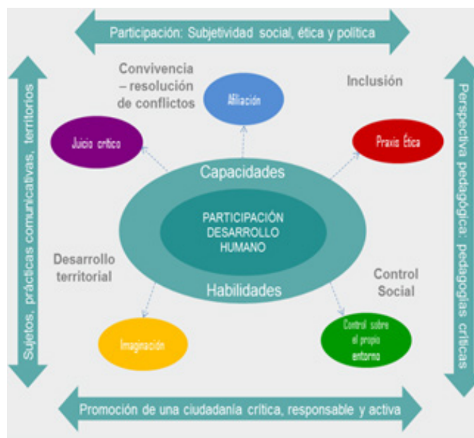
Figure 1. System for Citizen Education on Participation