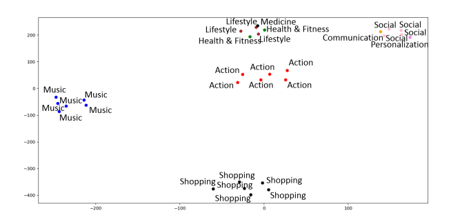
Fig. 2. Visual representation for applications and their categories given in Table 4

Not only quantitatively, but also qualitatively, the proposed application embeddings have proved its worth. It is not always the case that user provides a query term for app retrieval, a user may want to get some recommendations based on a particular app. Similar to [4], nearest neighbor analysis acts as recommender tool to get the closest match