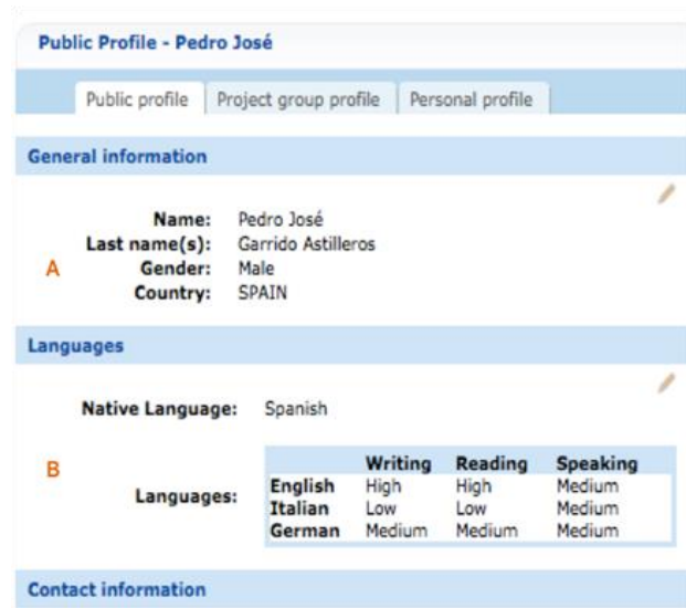
Fig. 3. Public profile information provided by trusty