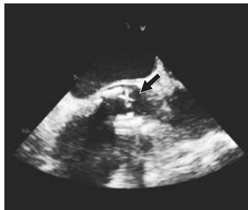
Figure 2: View of the prosthetic aortic valve in transesophageal echocardiography.

The transesophageal echocardiogram in mode 2D and 3D showed three little masses suggestive of vegetations in the aortic prosthetic valve. In the image ( Figure 2 ), a small and mobile mass is observed (black arrow) about 2 \times 2 \text{ mm} on the ventricular side of the prosthetic aortic valve, at the level of prosthetic discs that are not commonly seen clearly, due to interposition of the valve stent/struts. 1