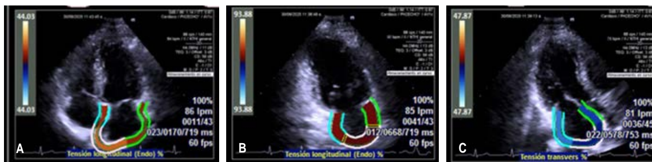
Figure 1: Representation of the tracing of the atrial border for obtaining left atrial strain in the three apical planes: A) 4 chambers, B) 2 chambers, C) 3 chambers.

Left atrial strain ( Figure 1 ) is acquired in the apical 4-chamber, 2-chamber, and 3-chamber views. The endocardial border is traced, excluding the entrance of the pulmonary veins. Currently, it has been described that it can only be acquired in a 4-chamber view, but there is also a biplane mode analysis by adding