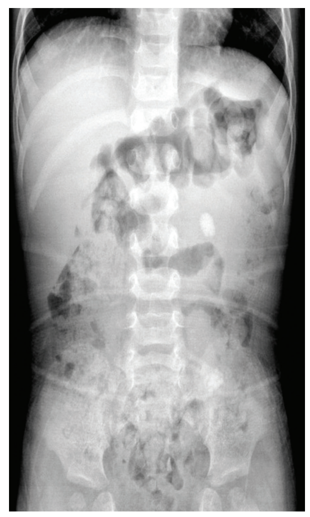
Figure 1. Pre-extracorporeal shock wave lithotripsy X-ray for stone.

stone burden, and then repeated on the contralateral side. Patients without positive results typically underwent sessions, and one patient had three sessions. Surgical procedures were evaluated in patients undergoing ESWL without positive results. The demographic data of the patients are given in table 1. Patients were recalled for a follow-up USG evaluation after 3 months.