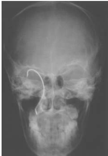
Figure 2. In the AP projection we can see a simple-single barbed fishhook.

The ocular injuries by fishhook are uncommon and have a high risk of severe damage and lost of vision, for both reasons the management of this injuries is important. In the actual literature there are reports of ocular damage with penetrating or non-penetrating injuries and they are a public health problem. We found different causes of ocular trauma thus organic material even fetal monitoring spiral electrode, pens, airbags, stones, human bites or animal bites, toys, fall downs, furniture, clothing hooks, etc., had been referred in literature. 2-4