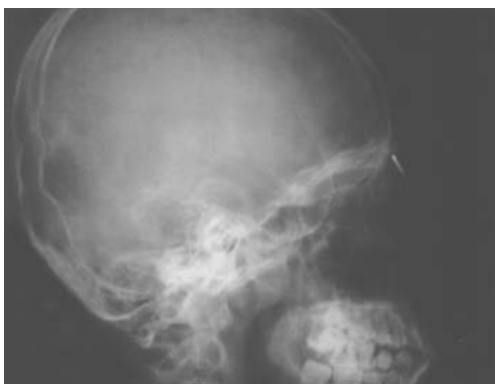
Figure 3. In the lateral projection we can see the fishhook respecting the bony structures.

In Mexico at pediatric ages there is a report by Ugalde et al. 2 Found, in five years, 53 traumatic eye cases: 17 patients suffered injuries by fall downs and nine of them with clothing hooks, in 46 the injury occurred at home and a family member was witness.