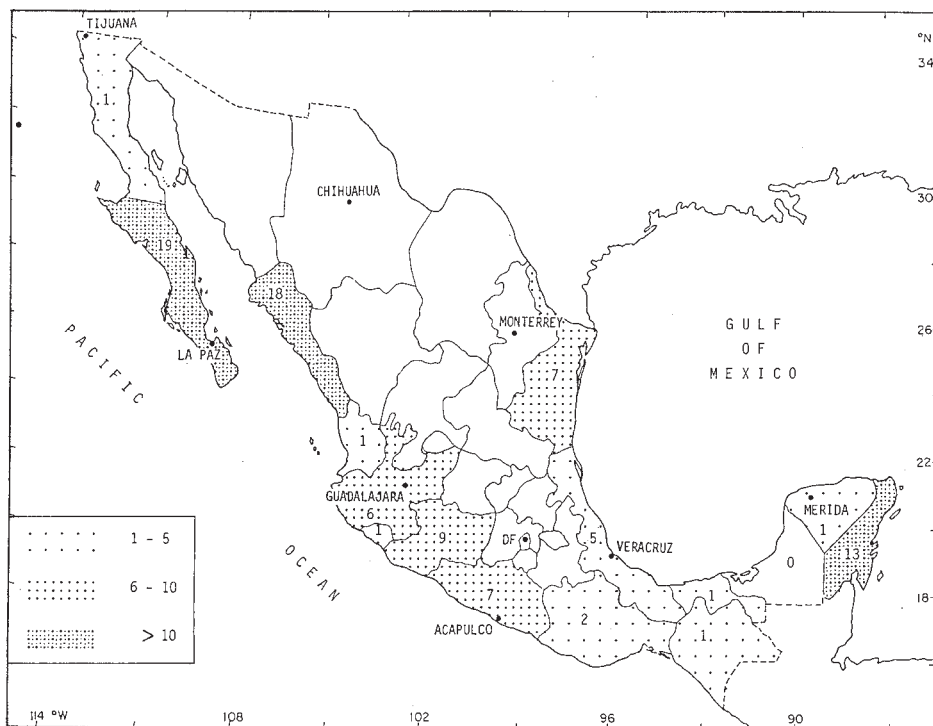
Fig. 1. Number of landfalling hurricanes (all categories) by states in México. 1951-2000 period.