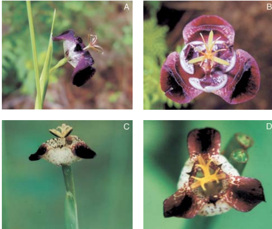
Fig. 3. Tigridia pugana (A, B) and T. pulchella (C, D). A and B are photos of the holotype by L. Ortiz-Catedral. C and D are photos by A. Rodríguez ( A. Rodríguez & A. Kennedy 4427 , IBUG).

style arms; ovary oblong-clavate, 4-7 mm long; mature capsule oblong-clavate, 1-1.6 cm long, 4.5-5.5 mm wide; seeds pyriform, brown, 3 mm long; flowering in late August-September, fruiting in October-November.