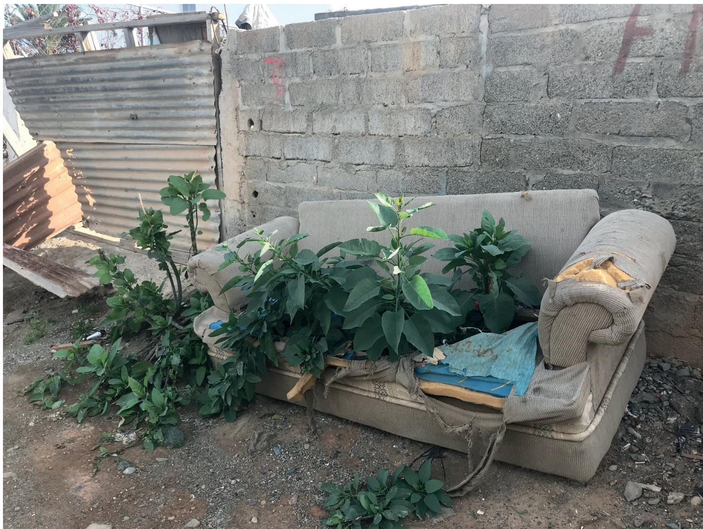
Figure 2: Nicotiana glauca Graham (an invasive plant) growing in a disturbed area near Cedros Village, Baja California, Mexico.

In 2018, Vanderplank et al. published updated vascular plant checklists for the Baja California Pacific Islands, which documented 307 plants on Cedros Island, including 256 native plants, 51 non-native plants and 15 single-island endemic plants. The goal of this study was to document newly arrived plant species on Cedros Island, Baja California, Mexico.